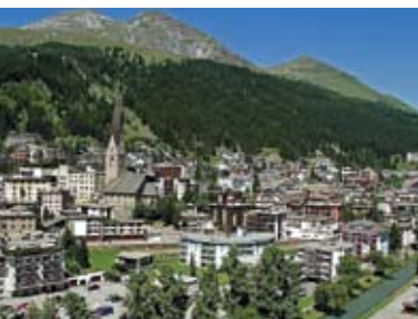
Looking down at the city of Davos, Switzerland, site of the European Urology Forum 2010.