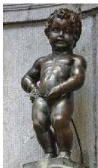
Manneken-Pis "Peeing Boy" Brussels