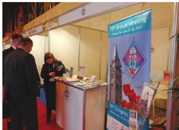
CUA at EAU 2015 in Madrid