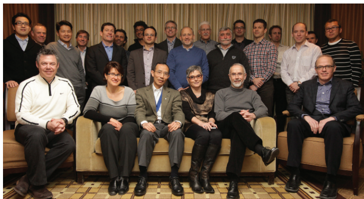
2013 Winter Executive Committee Meeting.

These reassignments will need to be ratified at the 2013 AGM in June, but I'll try to make it as painless as possible.