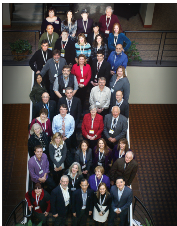
Participants of the GU Cancer Survivorship Meeting, 2013.