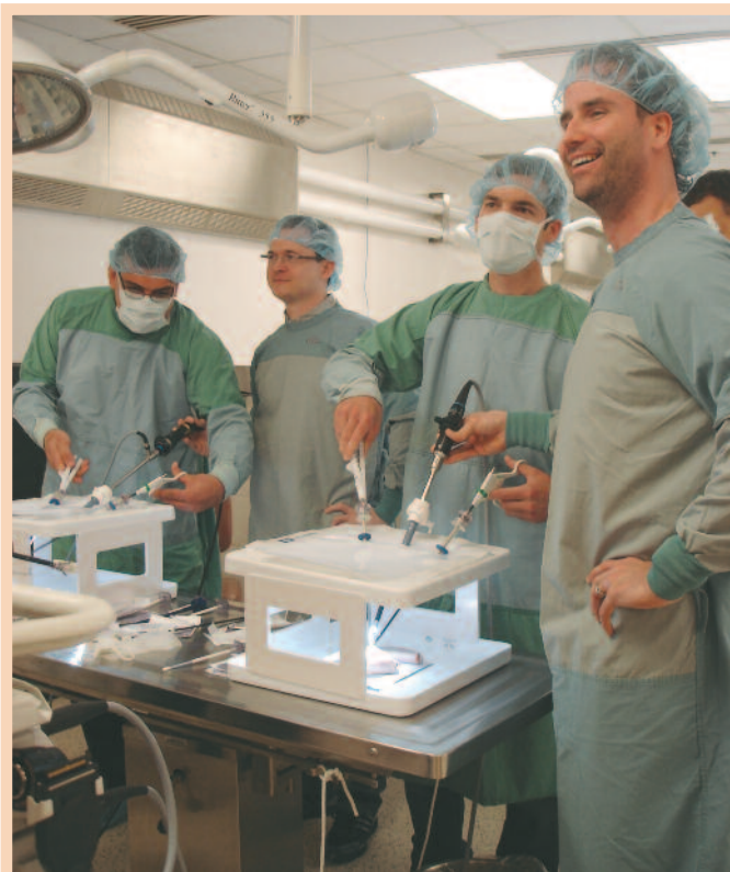
Laparoscopy course at the University of PEI Atlantic Veterinary College.