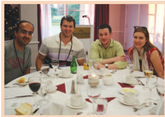
CSUR supper at the Rodd Brudenell Resort, PEI.

this Executive position is of interest to you, please do not hesitate to contact me to learn more about it at vpeducation@cua.org .