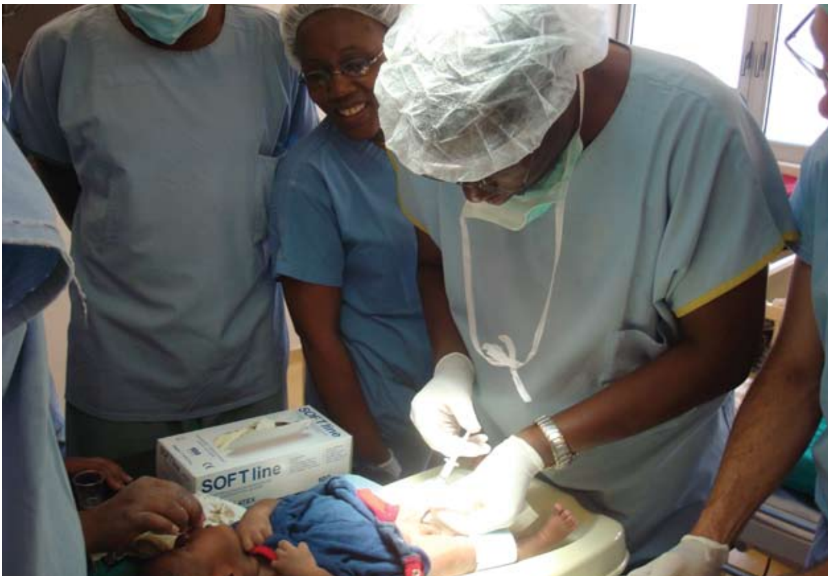
Male circumcision is performed in Africa.

Coincidentally over the last few years, the CUA Executive has worked to support the development of an Office of Patient Advocacy, to lend the help of the CUA in a variety of ways. As part of this effort, we will be convening an interest group at the Charlottetown CUA Annual Meeting in June. Our group would like to see as many CUA members, residents and others who have an interest in this initiative show up and start this worthwhile process. In preparation for this meeting, we will be sending out a survey to ask members about their previous experience, their interest in volunteering in Africa and other places, and their ideas for the future direction for the CUA in international efforts and policy development in areas of urology. Please join us if you can. The date, time and place will be announced in the near future. As a citizen of one of the most wealthy nations on the planet, you will find that it feels very good to give back! ✿