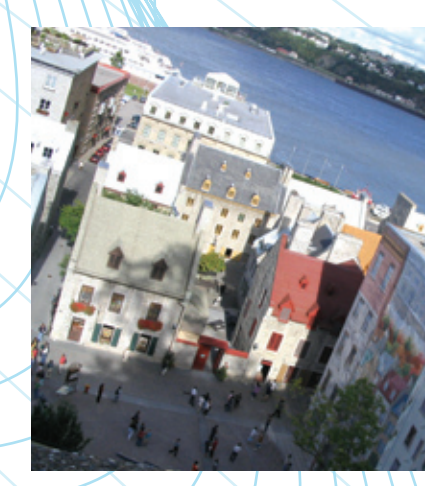
Future CUA Meetings

June 24-27, 2007 Centre des congrès Québec City, QC